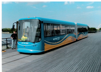
UK Loco 150 passenger tram