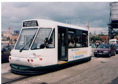
PPM 35 passenger tram