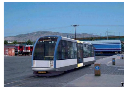
TDI Mini Tram 50 passenger tram

For further information on Ultra Light Rail, please contact: -