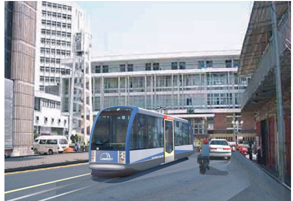
Seventy passenger tram designed by TDI

Intermediate Public Transport – Investment in urban public transport is currently focused almost exclusively on either conventional Light Rail that is clean but expensive or on buses, which can be cheaper but have serious disadvantages. The diesel bus is the standard form of public transport used in urban areas, except where dense population and heavy traffic justify the use of conventional Light Rail. However, the urban diesel bus is incompatible with the latest governmental policies on environmentally friendly transport. Trams also have a better record than buses for encouraging a significant modal shift away from private cars to public transport.